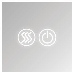
Touch sensors for light and demister